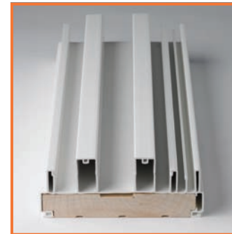
Vinyl Clad Header